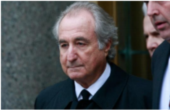
Figure 3 Bernie Maddoff

Below are a list of victims and offenders for you to research: