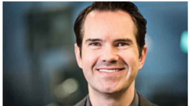
Figure 4 Jimmy Carr